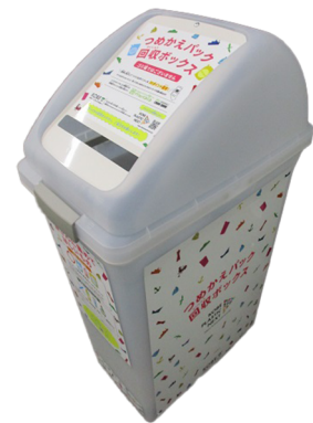
Collection boxes scheduled to be established on October 1